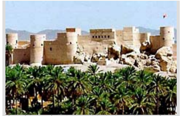
One of the two forts that guard the harbor at Muscat, Oman

Follow the track of the Arabian Sea's strongest cyclone on record, starting from the bottom of this page.