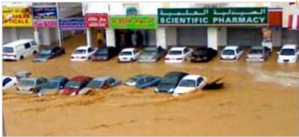
Floodwaters raging through a Muscat, Oman, street

The name for Cyclone Gonu is from the Maldives, not far from where it first began to form, where it refers to 'a bag made from palm leaves'.