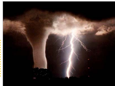
Stormy weather over the Gulf - "We're not in Muscat any longer..."