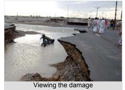
Viewing the damage