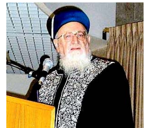
Rabbi Mordechai Eliyahu

This excerpt is from the Jerusalem Post of May 30, 2007. Readers who have been following our series on Rabbinic Judaism will not be surprised at the references to earlier sages, in this case Maimonides: