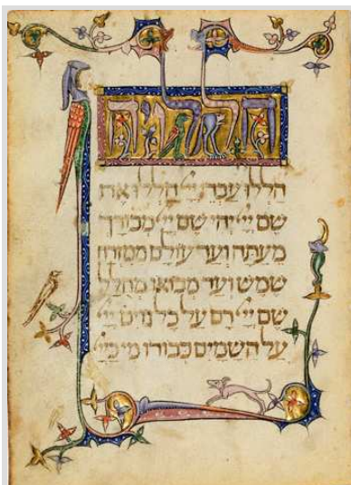
A folio from the Prato Haggadah , a Midrash, originating in Spain. One of the moral tales in this document is that of the four sons: the wise son , the wicked son , the simple son , and the son who does not know how to ask .

The Hebrew Bible – Tanakh , Old Testament – was compiled during the Second Temple period; between the Restoration led by Nehemiah and Ezra, and the AD 70 destruction of the temple. The Tanakh has the temple sacrificial system as central to the religion, familiar to us from the Old Testament, and from New Testament records of contemporary practice. By the time the Patriarchate was instituted in the 2 nd century the Rabbis were in firm control of the Jews' religious practices, and through the Yeshivas they developed a system of religious writings that would eventually supplant the Tanakh.