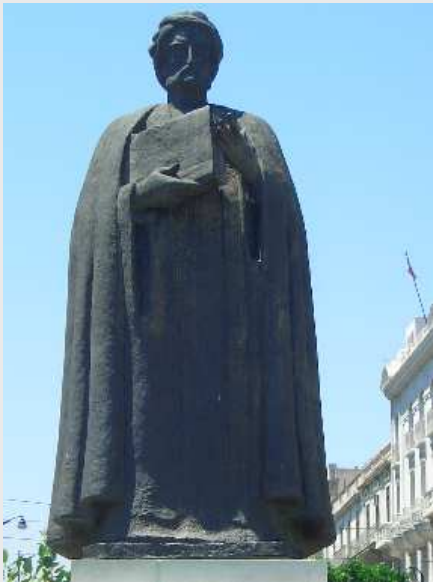
Statue of Ibn Khaldoun on Avenue Habib Bourguiba, Tunis.