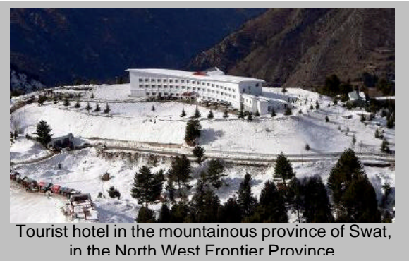
Tourist hotel in the mountainous province of Swat, in the North West Frontier Province.