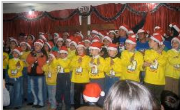
Children at the AWANA's Christmas celebration in Gaza