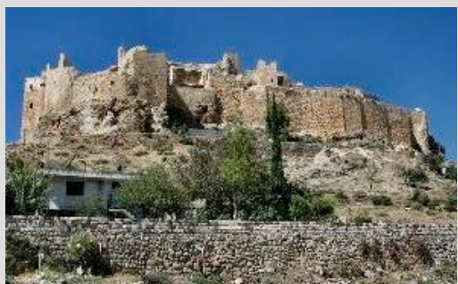
The castle at Masyaf is being restored by the Aga Khan foundation.