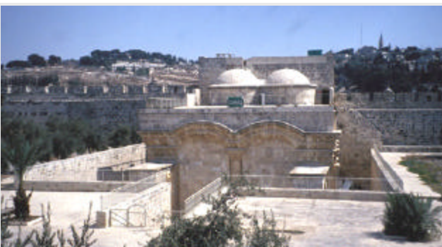
This picture of the Gate of Mercy and Gate of Grace is taken from inside the Haram al Sharaf. The Mount of Olives can be seen in the background. The outer and inner gates are sealed, enclosing the gatehouse which is used as a mosque to which a small door gives entrance.